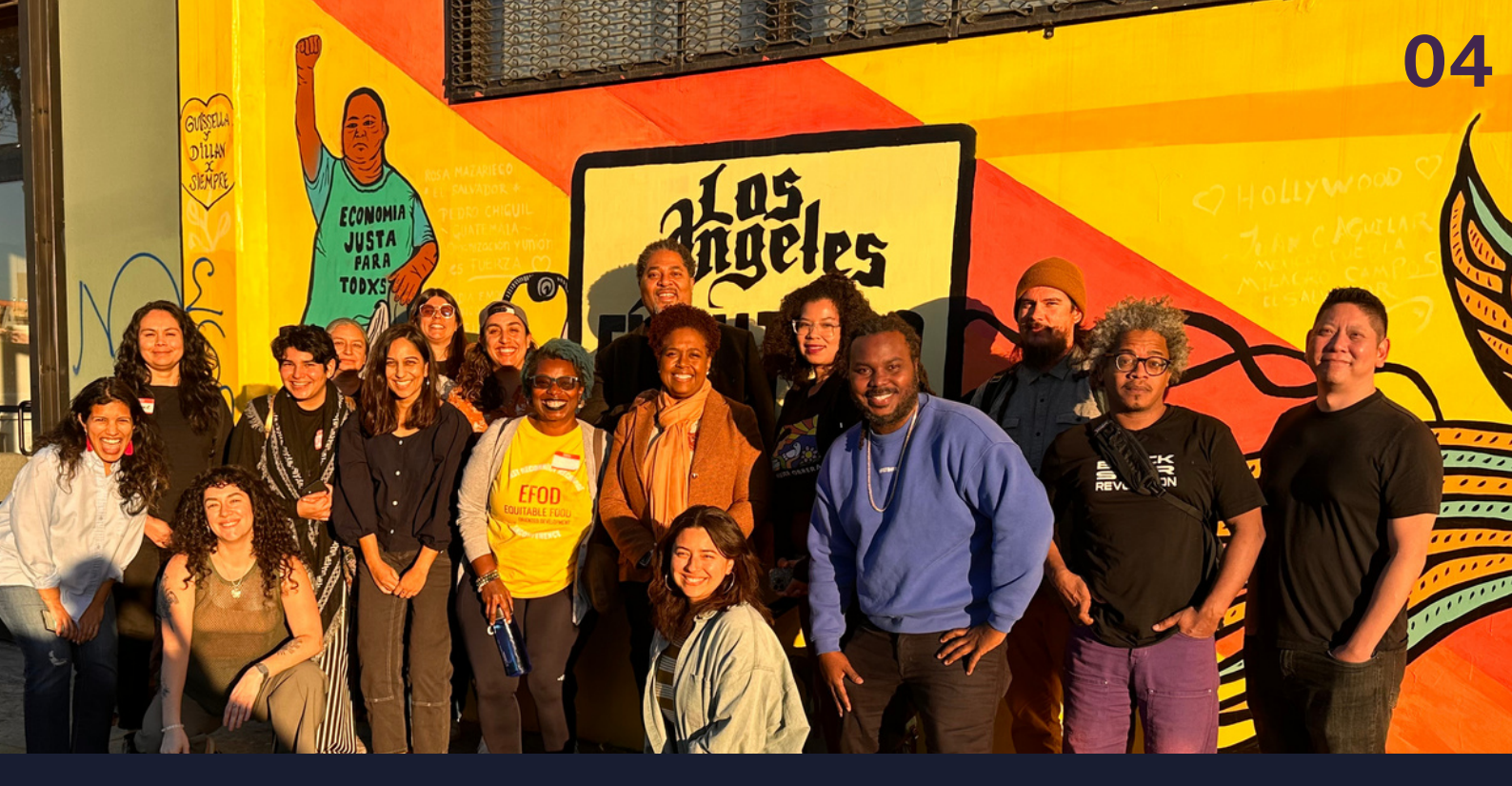
Photo Description: EFOD Steering Committee members strategizing in Los Angeles, pictured in front of SC member org Inclusive Action for the City